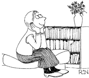
Wendy checked the message on her mobile